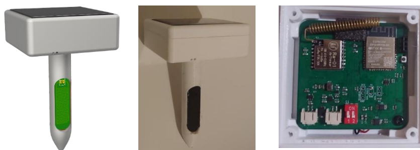
Figure 2: 3D enclosure design, real enclosure, PCB

A waterproof box was designed in Autodesk Fusion 360 for the individual components and the circuit board. The box consists of three main parts: the lid on which the solar panel is mounted, the body in which the PCB is placed and the stem which contains the EC probe, the DS18B20 sensor and the interdigital capacitor for water content measurement. Designed box and DPS are shown in figure 2.