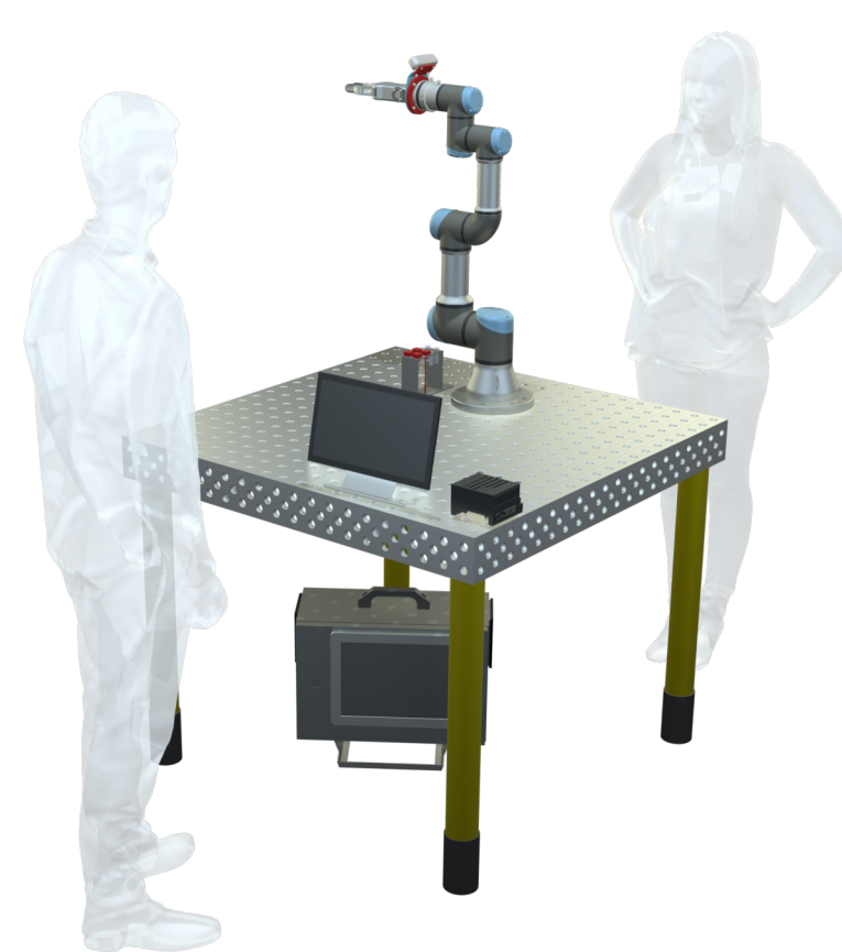
Figure 2. Robo Medicinae I - Visualisation of robotic platform

Other integral parts of the design is the Intel Realsense D435i, the RG2, and the HEX-E sensor. These sensors and the gripper came together in the design of the customized gripper. Everything is then connected to the control unit, which can take the form of a powerful single-board or desktop computer. As a web-based application, the operator has the possibility to control it from his or her device (e.g. tablet) using a web browser. However, the condition is that the device must be connected to the same local network. All these sensors and the gripper had to be combined and integrated into a complete gripper. The challenge was to create a modular gripper with individual parts that could be disassembled and replaced, for example, with another type of 3D camera.