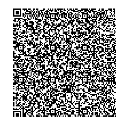
Figure 5. Thesis citation